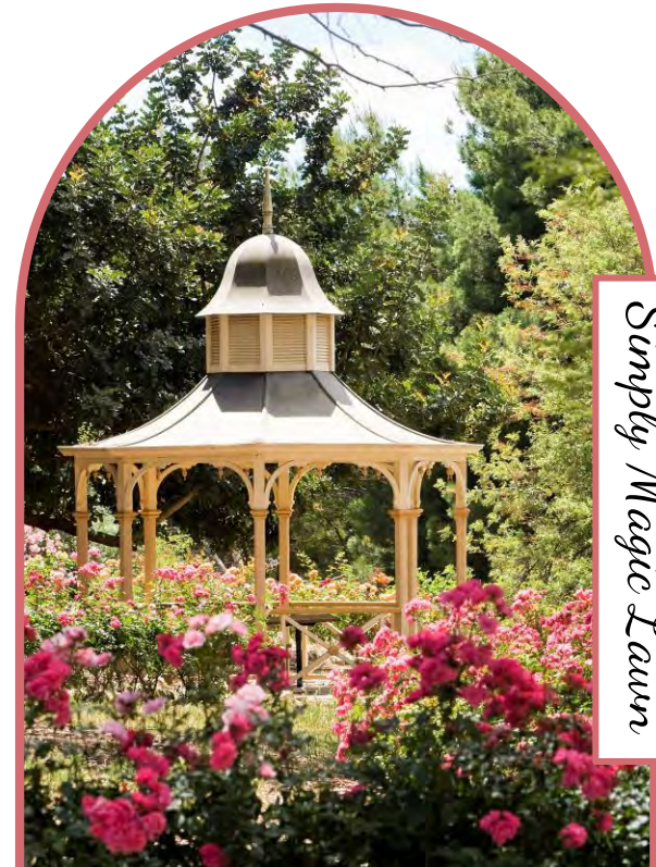
Simply Magic Lawn

Add a splash of Royalty to your special day and step into the garden that was opened by HM Queen Elizabeth II in 2002. The Chateau is the perfect backdrop for those very special vows, stunning views surrounded by 30,000