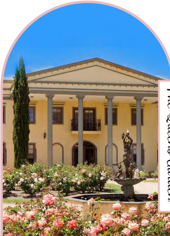
The Queens Garden

Seduction Lawn is the perfect place to hold your ceremony. Steps shouldered by standard seduction roses make the perfect entrance to lead you to the large open grass area surrounded by roses and stately trees, one of the most romantic settings in the Barossa overlooking the Barossa Ranges.